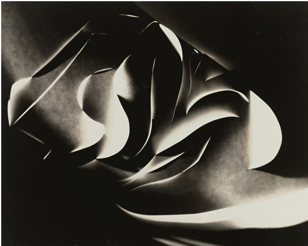
Francis Bruguière - Cut Paper Abstraction c. 1929